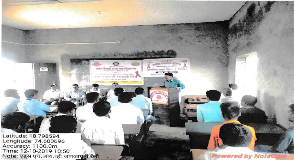
Latitude: 18.798594 Longitude: 74.600696 Accuracy: 1100.0m Time: 12-10-2019 10:50 Note: एड्स एच.आय.व्ही जणजागृती रॅली