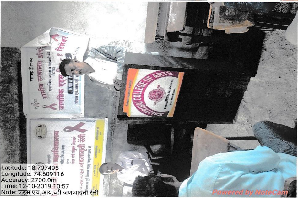
Latitude: 18.797495 Longitude: 74.609116 Accuracy: 2700.0m Time: 12-10-2019 10:57 Note: एड्स एच.आय.व्ही जणजागृती रॅली